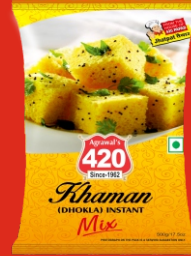
Khaman (Dhokla) Mix