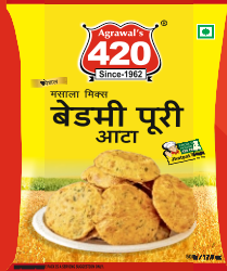
Masala Mix Bedami Poori Atta