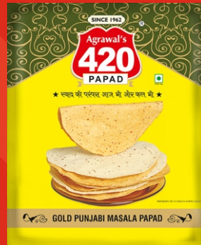
Gold Punjabi Masala Papad