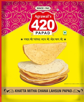
Khatta Mitha Chana Papad