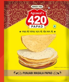
Punjabi Masala Papad