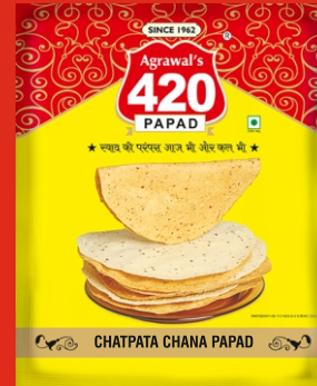
Chatpata Chana Papad