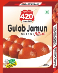
Gulab Jamun Mix