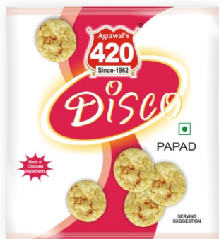
Moong Disco 1kg Pack