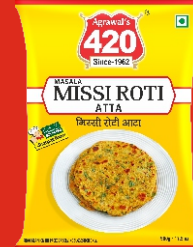
Masala Mix Missi Roti Atta