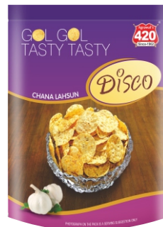
Chana Lahsun Disco